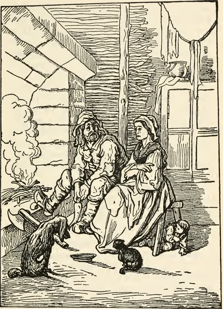
"SLIPPED UNDER HIS FATHER'S SEAT."